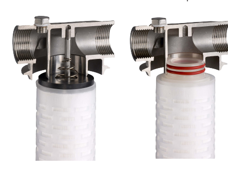
Double Open Ended